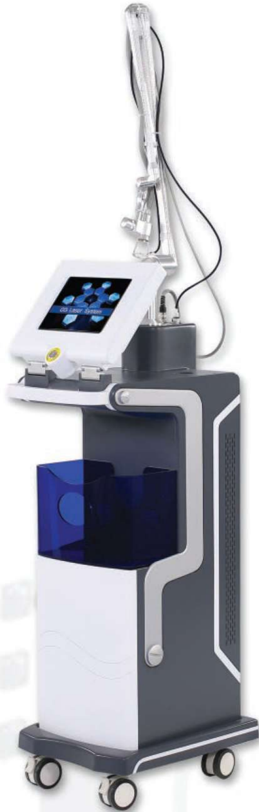
Fractional + UltraPulse + Gynae (Optional)