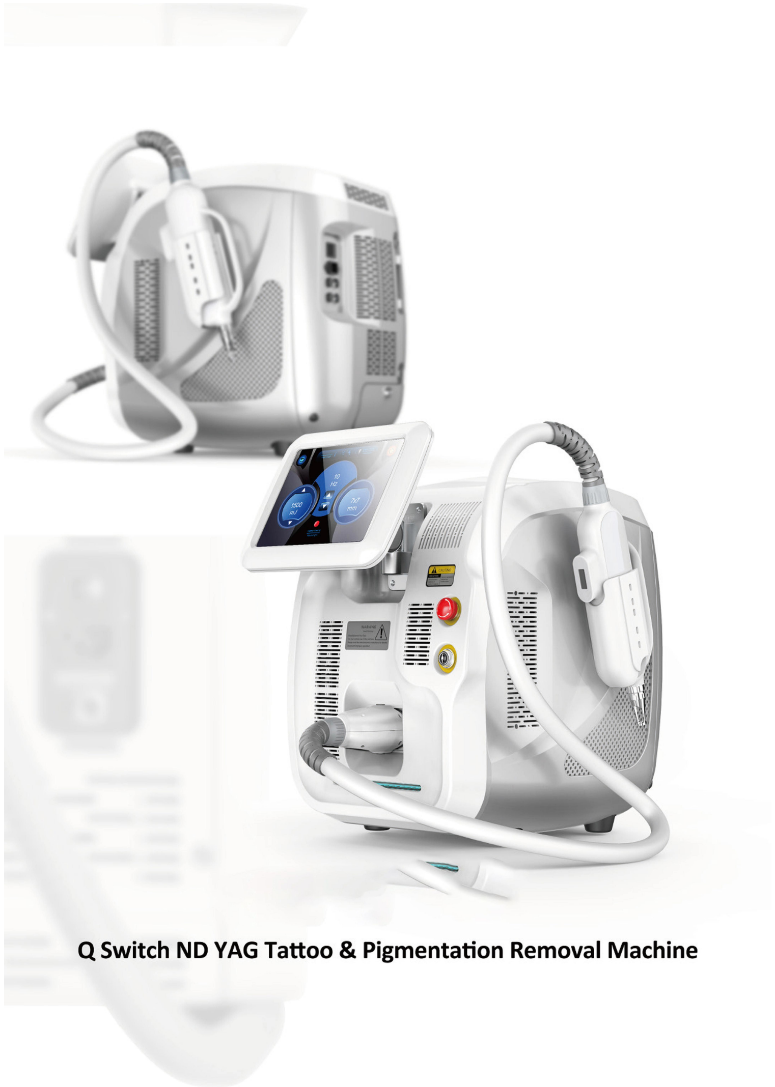
Q Switch ND YAG Tattoo & Pigmentation Removal Machine